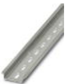
DIN rail, material: steel galvanized and passivated with a thick layer, perforated, height 7.5 mm, width 35 mm, length: 2000 mm

DIN rail perforated - NS 35/ 7,5 PERF 2000MM - 0801733