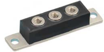
Three Tower Package

Maximum ratings, at T_j = 25\text{ }^\circ\text{C} , unless otherwise specified ("R" devices have leads reversed)