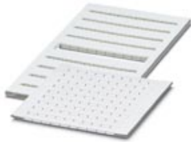
Flat zack marker sheet, white, For terminal block width: 4.2 mm

Please be informed that the data shown in this PDF Document is generated from our Online Catalog. Please find the complete data in the user's documentation. Our General Terms of Use for Downloads are valid ( http://download.phoenixcontact.com )