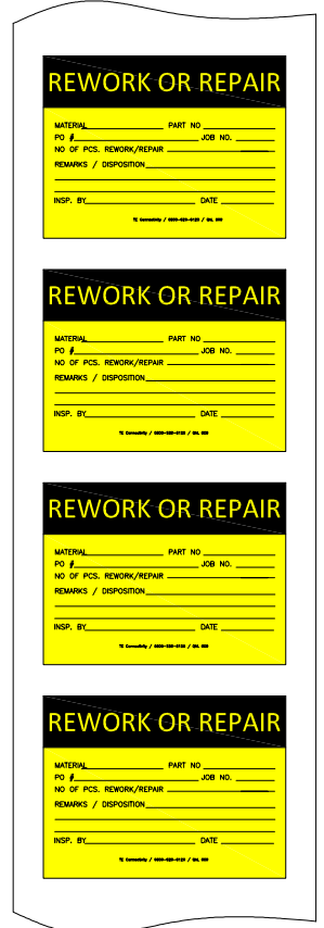
PARTIAL ROLL VIEW

NOTES FINISHED PRODUCT TO BE DELIVERED ON ROLLS AS SHOWN